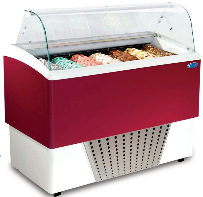
BRIO 7 Pans not included