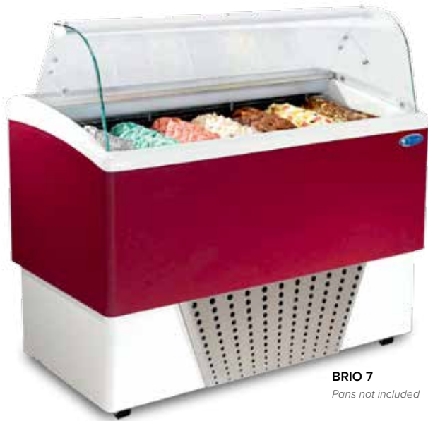
BRIO 7 Pans not included