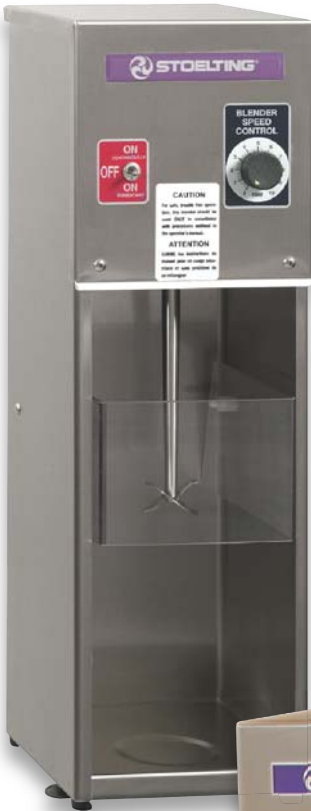
Dial Control Hand Operated Model