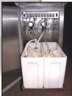
Refrigerated storage cabinet showing slide-out tray and bag connection system.